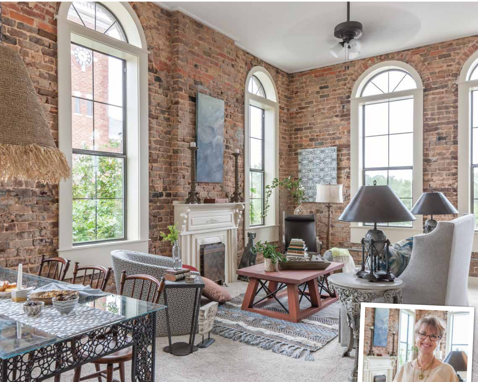
Designer Cindy Barganier gave this loft a "modern-meets-historic" aesthetic with a balanced mix of contemporary and traditional décor, such as sculptural lamps atop antique side tables. (Page 87) In the broad hallway, the formality of gold and bronze accents is juxtaposed by a sizeable calla lily charcoal on paper casually pinned to the wall. "It had to be massive to allow you to enjoy the ceiling height," Cindy says. A vignette flanked by fabric panels draws the eye down the long hall and conceals an open laundry room.