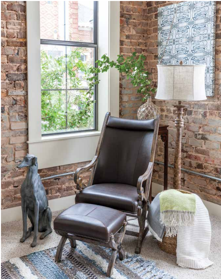
A cast-iron canine stands at attention by a living room seat with a downtown view. Abstract artwork and cozy throws, along with a multi-textured rug, soften the handsome space. (Opposite) On the dining bench—designed by Cindy and handcrafted by Freddie Daugherty—a whimsical llama print repeats the rust and cream colors of the bricks, as does a straw-hued light fixture overhead. The glass-top iron table echoes Freddie's staircases, seen just outside the window, a nod to the building's industrial feel.